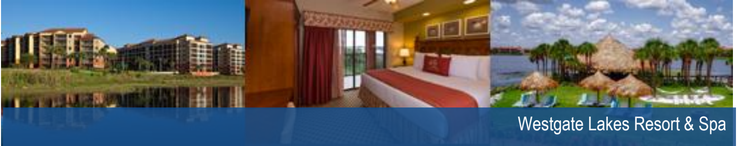
Westgate Lakes Resort & Spa