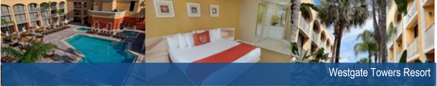
Westgate Towers Resort