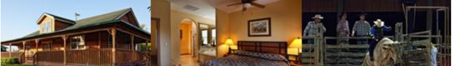
Westgate River Ranch Resort & Rodeo