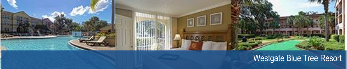
Westgate Blue Tree Resort