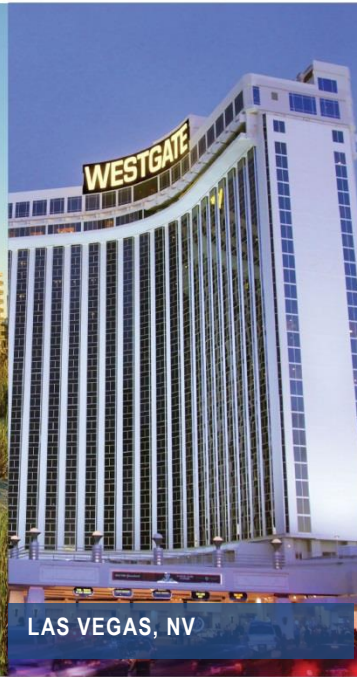
LAS VEGAS, NV