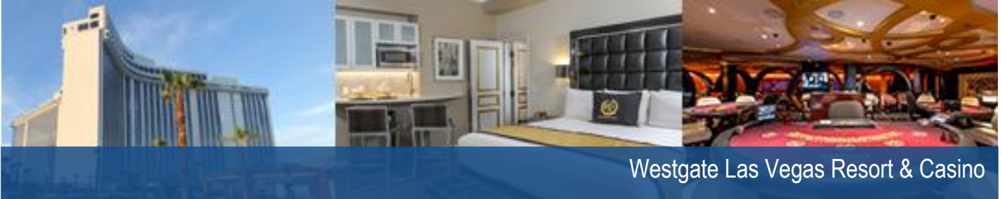
Westgate Las Vegas Resort & Casino