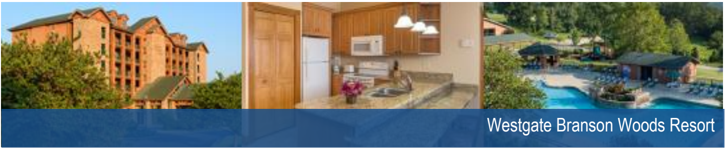
Westgate Branson Woods Resort