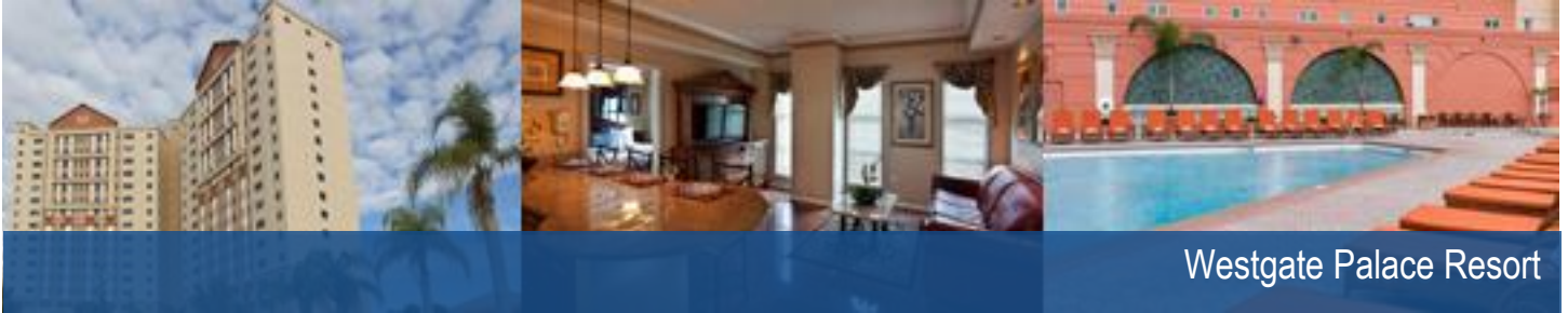
Westgate Palace Resort