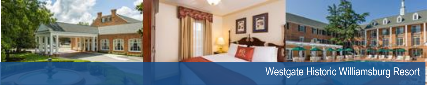
Westgate Historic Williamsburg Resort