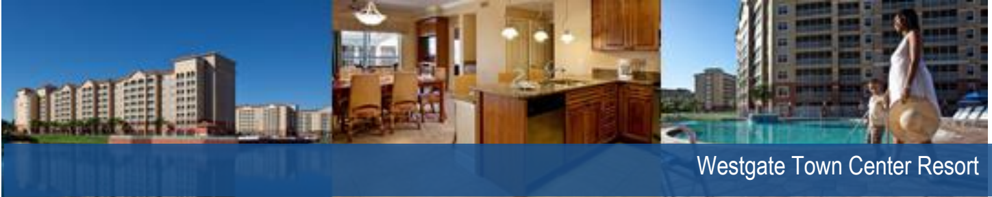
Westgate Town Center Resort