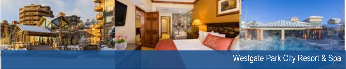
Westgate Park City Resort & Spa