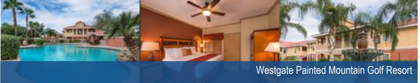
Westgate Painted Mountain Golf Resort