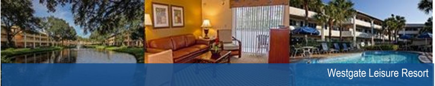
Westgate Leisure Resort