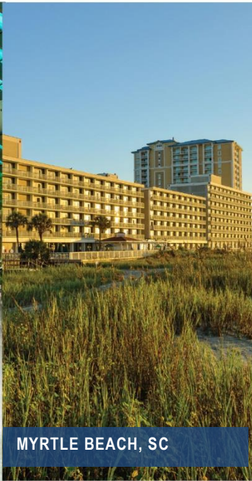
MYRTLE BEACH, SC