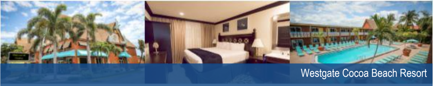
Westgate Cocoa Beach Resort