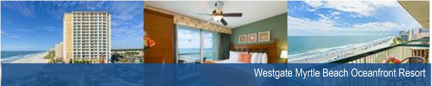
Westgate Myrtle Beach Oceanfront Resort