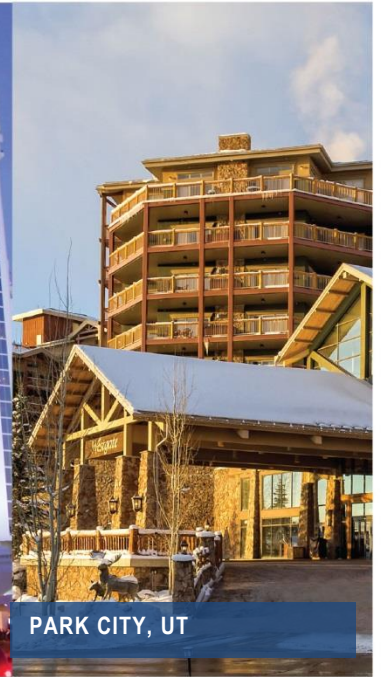
PARK CITY, UT