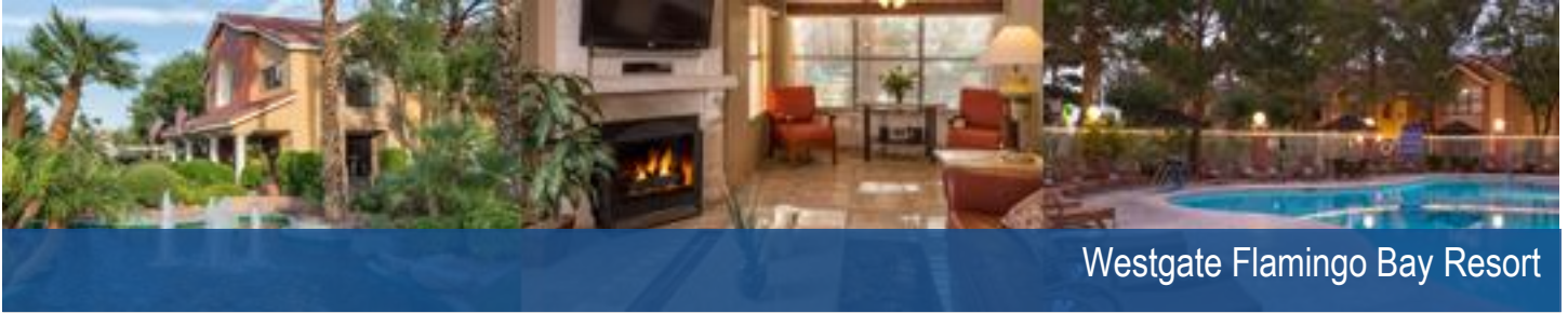
Westgate Flamingo Bay Resort