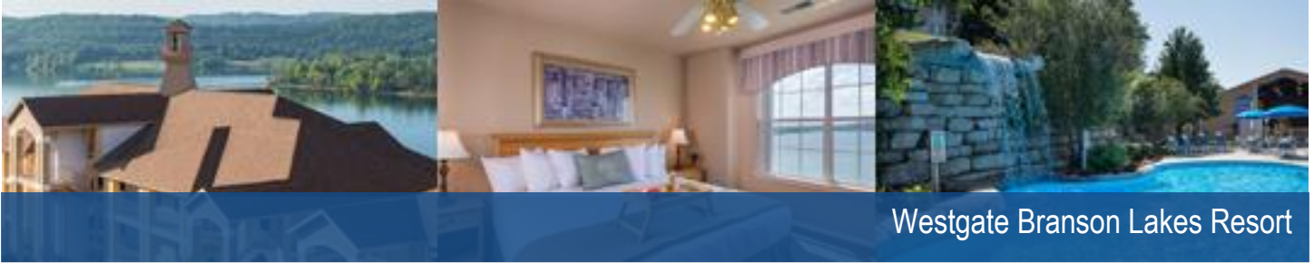
Westgate Branson Lakes Resort