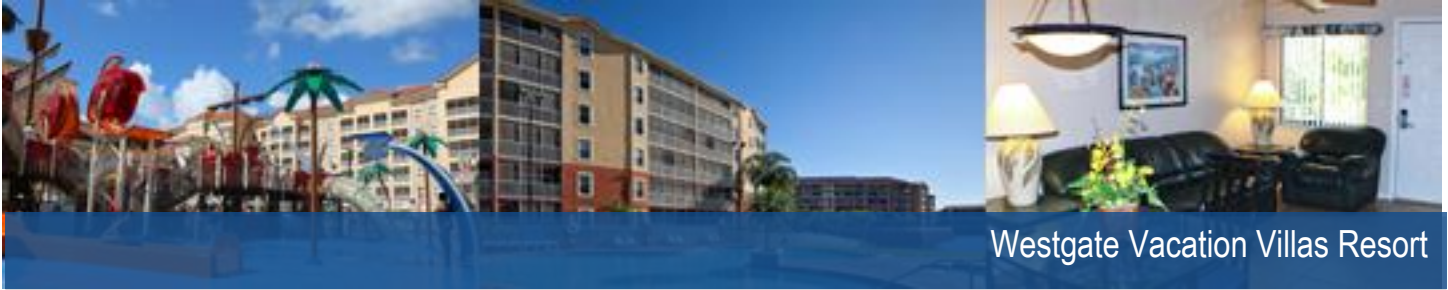
Westgate Vacation Villas Resort