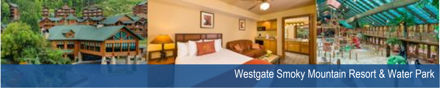
Westgate Smoky Mountain Resort & Water Park