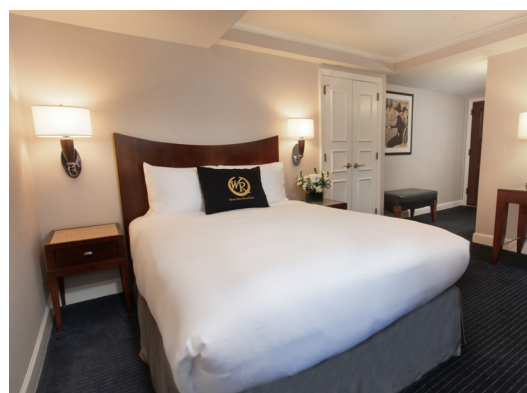
Signature Queen Sleeps 2 | 1 Queen | 258 sq ft