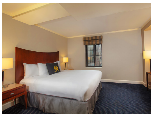
Signature King Sleeps 2 | 1 King | 248 sq ft