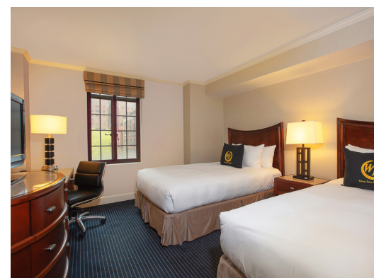
Signature Two Double Beds Sleeps 4 | 2 Double | 226 sq ft