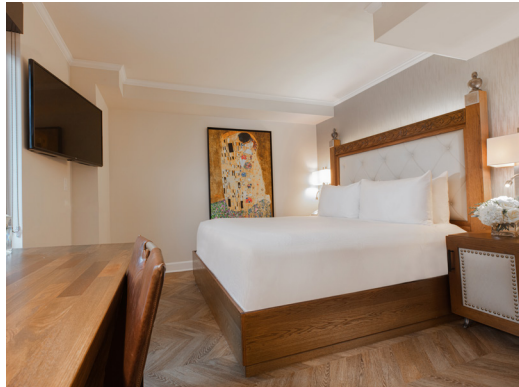
Luxe King Sleeps 2 | 1 King | 220 sq ft