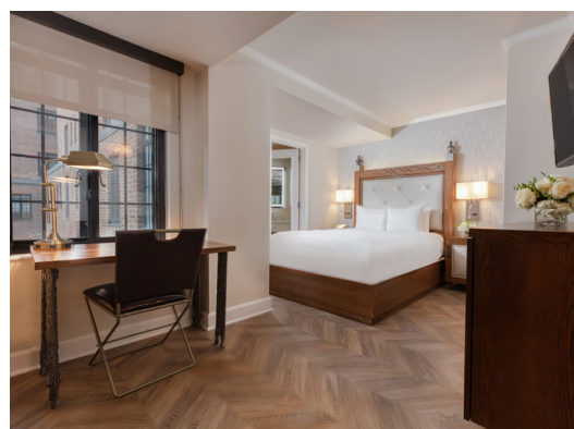
Luxe Queen Sleeps 2 | 1 Queen | 200 sq ft

Westgate New York Grand Central is proud to present our newly renovated Luxe Rooms. Located in Midtown Manhattan's historic Tudor City neighborhood, Westgate New York Grand Central offers several room type options – from elegantly decorated standard rooms with one or 2 beds to luxurious one bedroom balcony suites with expansive East River and NYC Skyline views.