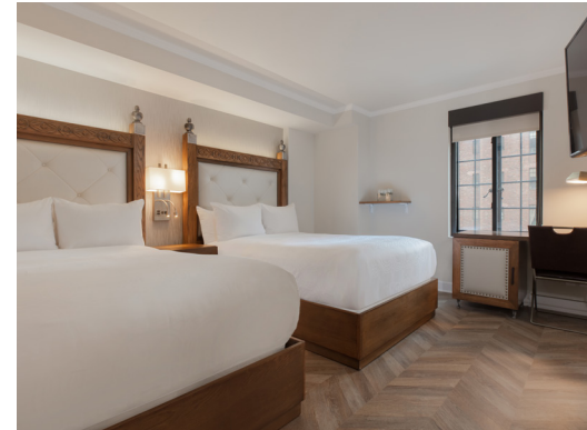
Luxe Two Double Beds Sleeps 4 | 2 Double | 220 sq ft