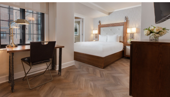
Luxe Queen Sleeps 2 | 1 Queen Bed

Our tastefully appointed and uncommonly spacious guest rooms pay homage to the neighborhood's historic past. Room types range from Standard Rooms with 1 or 2 beds to 1-Bedroom Suites – many with balconies offering expansive views of the East River and NYC Cityscape.