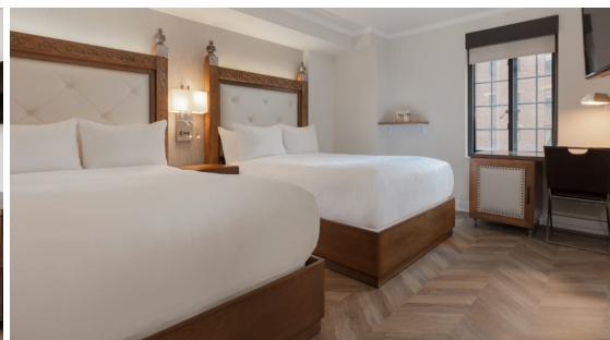
Luxe Two Double Beds Sleeps 4 | 2 Double Beds