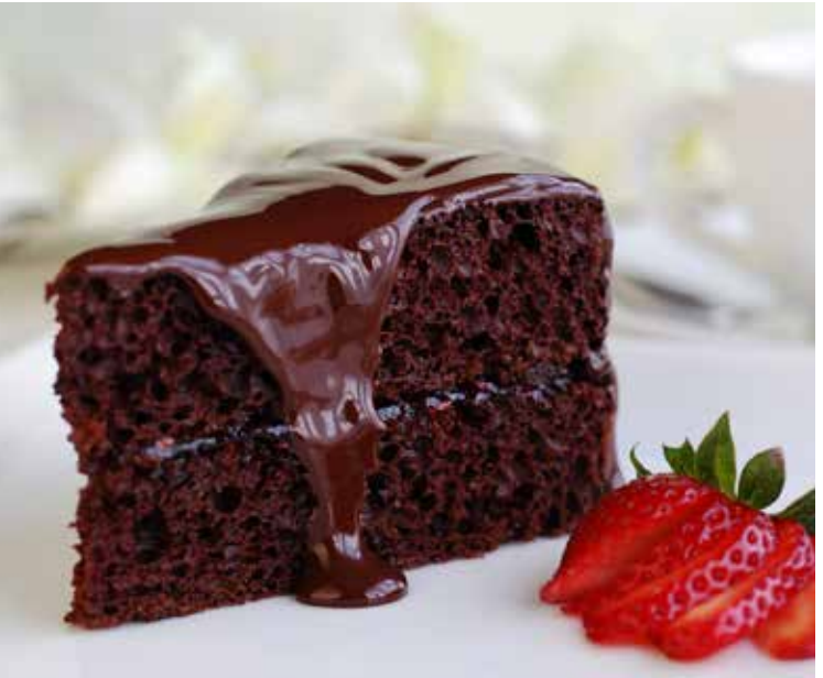
Consuming raw or undercooked meats, poultry, seafood, shellfish or eggs may increase your risk of foodborne illness. Menu items may contain or come into contact with wheat, eggs, peanuts, tree nuts, fish, shellfish, soy and milk. Please advise the Catering and Banquet Team of any known food allergies.