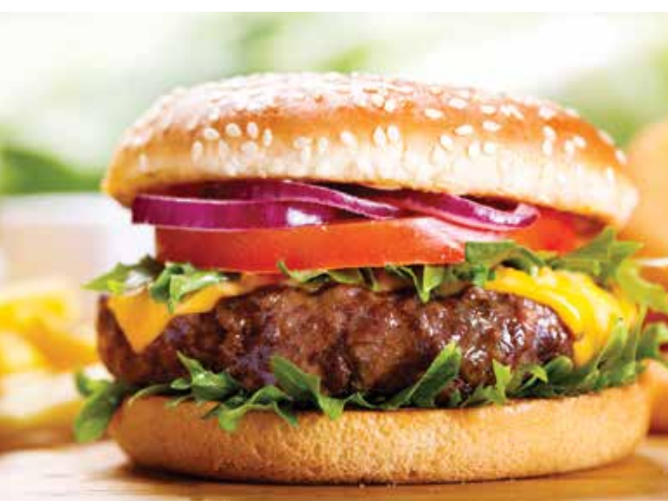
Consuming raw or undercooked meats, poultry, seafood, shellfish or eggs may increase your risk of foodborne illness. Menu items may contain or come into contact with wheat, eggs, peanuts, tree nuts, fish, shellfish, soy and milk. Please advise the Catering and Banquet Team of any known food allergies.