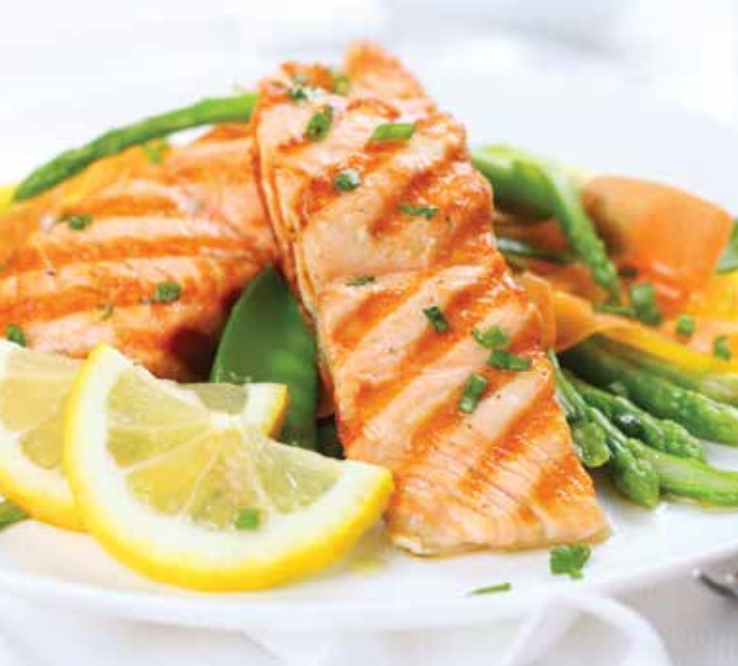
Consuming raw or undercooked meats, poultry, seafood, shellfish or eggs may increase your risk of foodborne illness. Menu items may contain or come into contact with wheat, eggs, peanuts, tree nuts, fish, shellfish, soy and milk. Please advise the Catering and Banquet Team of any known food allergies