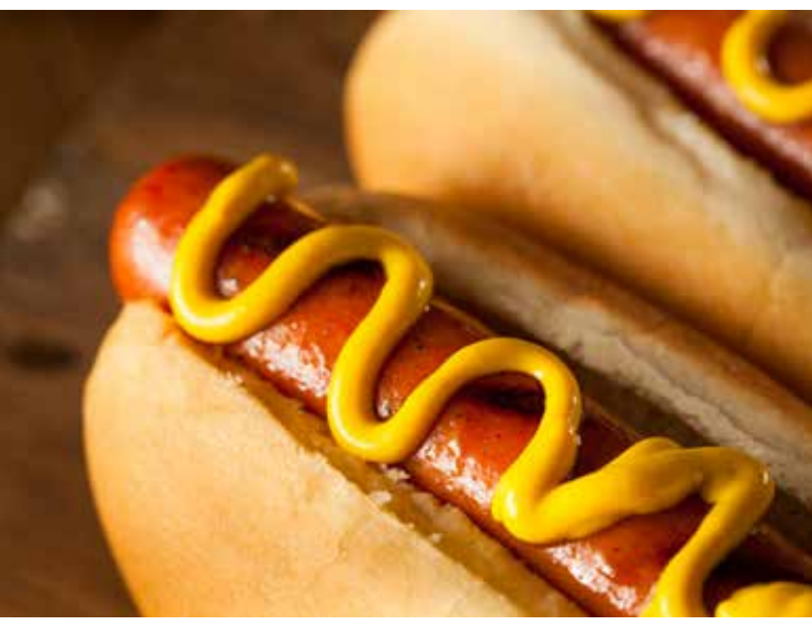
Consuming raw or undercooked meats, poultry, seafood, shellfish or eggs may increase your risk of foodborne illness. Menu items may contain or come into contact with wheat, eggs, peanuts, tree nuts, fish, shellfish, soy and milk. Please advise the Catering and Banquet Team of any known food allergies.