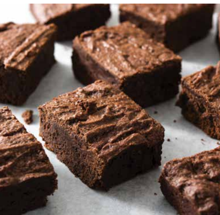
Consuming raw or undercooked meats, poultry, seafood, shellfish or eggs may increase your risk of foodborne illness. Menu items may contain or come into contact with wheat, eggs, peanuts, tree nuts, fish, shellfish, soy and milk. Please advise the Catering and Banquet Team of any known food allergies.