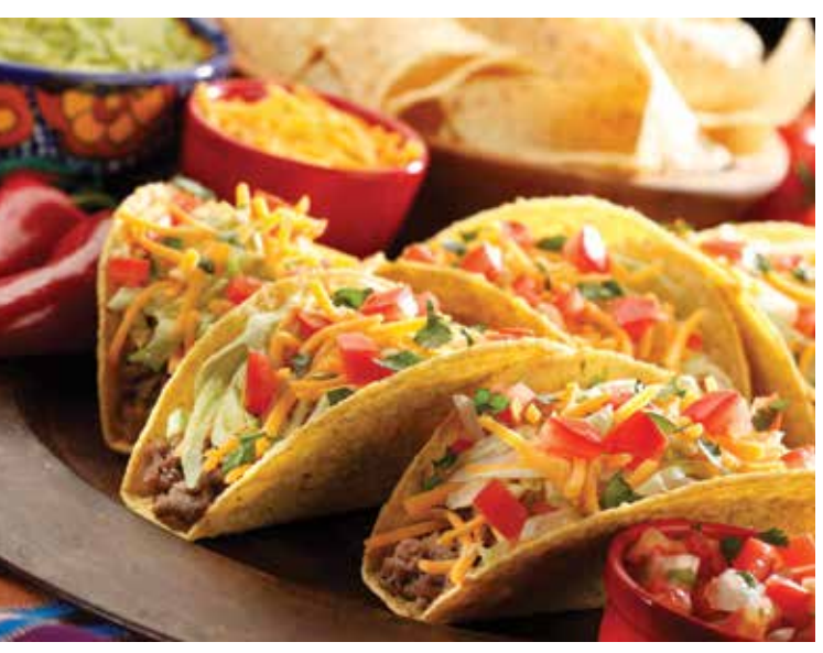
Consuming raw or undercooked meats, poultry, seafood, shellfish or eggs may increase your risk of foodborne illness. Menu items may contain or come into contact with wheat, eggs, peanuts, tree nuts, fish, shellfish, soy and milk. Please advise the Catering and Banquet Team of any known food allergies.