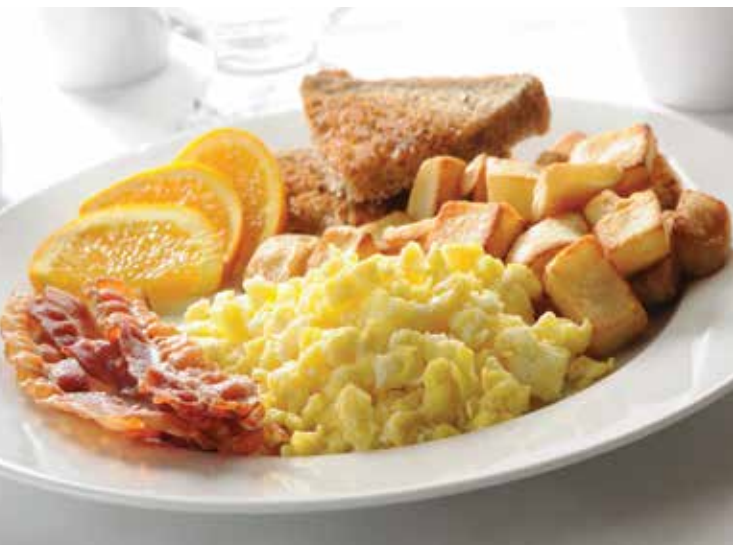
Consuming raw or undercooked meats, poultry, seafood, shellfish or eggs may increase your risk of foodborne illness. Menu items may contain or come into contact with wheat, eggs, peanuts, tree nuts, fish, shellfish, soy and milk. Please advise the Catering and Banquet Team of any known food allergies.