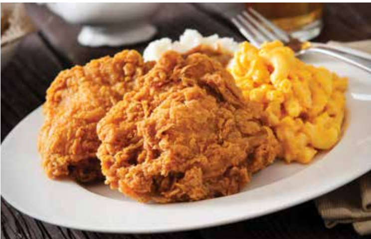
Consuming raw or undercooked meats, poultry, seafood, shellfish or eggs may increase your risk of foodborne illness. Menu items may contain or come into contact with wheat, eggs, peanuts, tree nuts, fish, shellfish, soy and milk. Please advise the Catering and Banquet Team of any known food allergies.