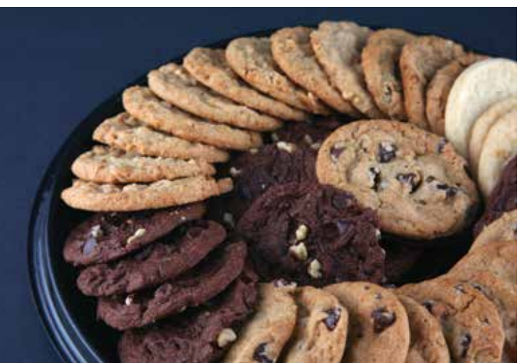
Consuming raw or undercooked meats, poultry, seafood, shellfish or eggs may increase your risk of foodborne illness. Menu items may contain or come into contact with wheat, eggs, peanuts, tree nuts, fish, shellfish, soy and milk. Please advise the Catering and Banquet Team of any known food allergies.