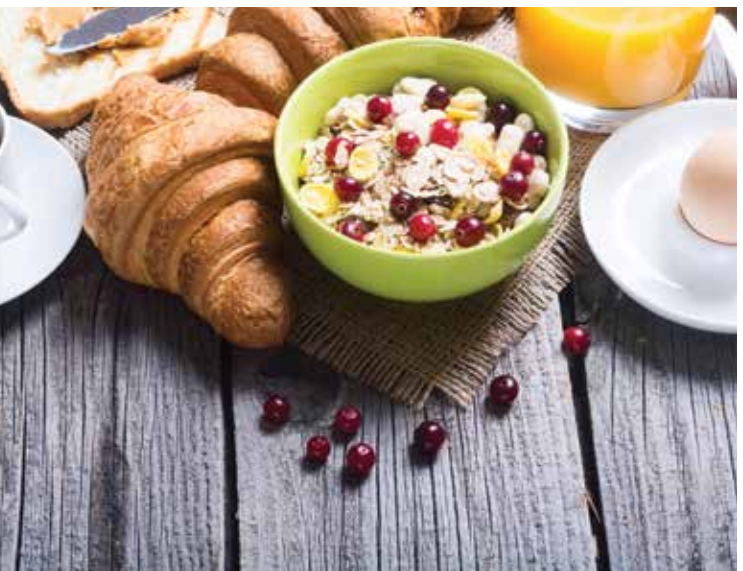
Consuming raw or undercooked meats, poultry, seafood, shellfish or eggs may increase your risk of foodborne illness. Menu items may contain or come into contact with wheat, eggs, peanuts, tree nuts, fish, shellfish, soy and milk. Please advise the Catering and Banquet Team of any known food allergies.