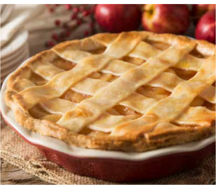
Consuming raw or undercooked meats, poultry, seafood, shellfish or eggs may increase your risk of foodborne illness. Menu items may contain or come into contact with wheat, eggs, peanuts, tree nuts, fish, shellfish, soy and milk. Please advise the Catering and Banquet Team of any known food allergies.