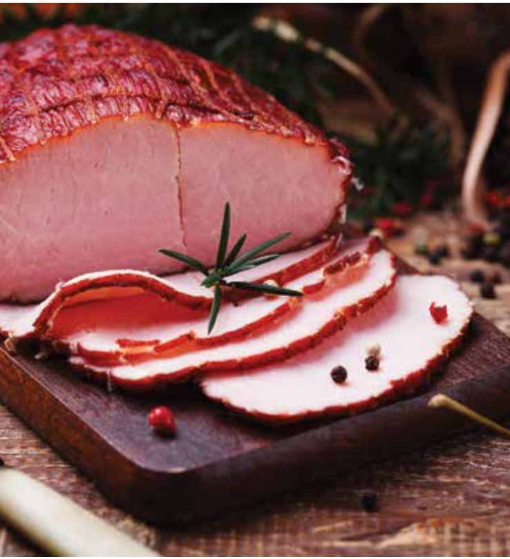
Consuming raw or undercooked meats, poultry, seafood, shellfish or eggs may increase your risk of foodborne illness. Menu items may contain or come into contact with wheat, eggs, peanuts, tree nuts, fish, shellfish, soy and milk. Please advise the Catering and Banquet Team of any known food allergies.